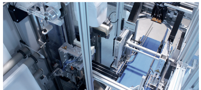
④ AG71-Labeling Singularisation and labelling zone