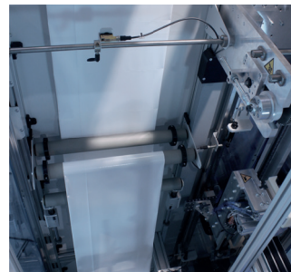
② AG71-Sleeve Feeding Stretch sleeve roll support systems